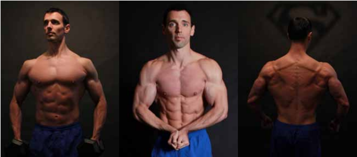
BEFORE BACK AFTER BACK